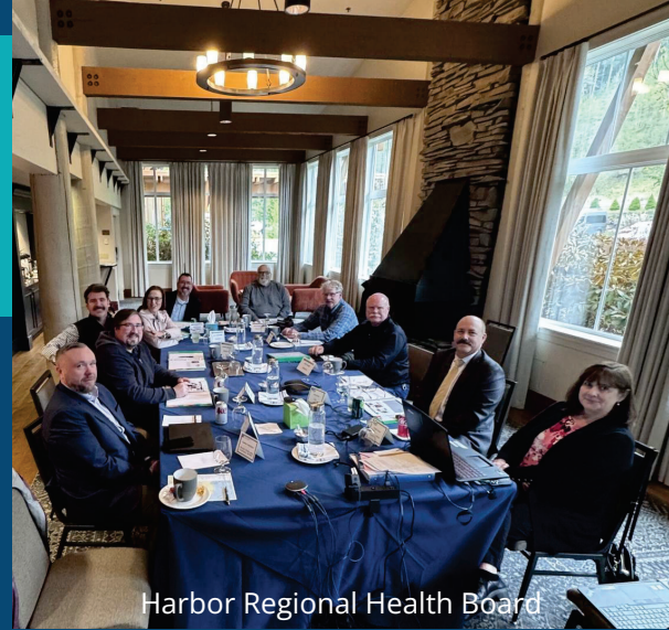
Harbor Regional Health Board

Under 20 minutes, governance education video shorts are designed to provide you with need-to-know education on a narrow topic. They are easy to use as an addition to your Board meeting agenda which help Board members learn together.